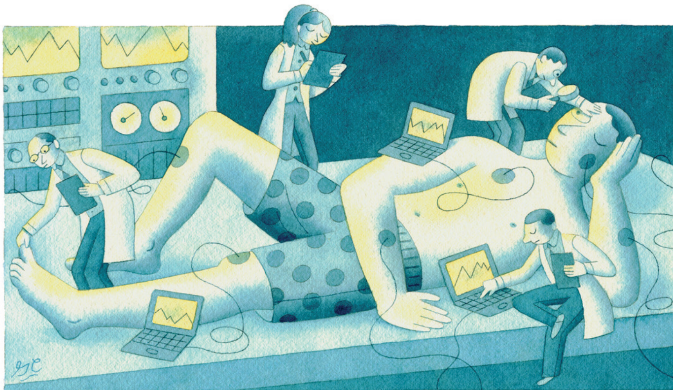
ILLUSTRATION BY GREG CLARKE

SPRING BOOKS Grind, politics and dirty tricks in life of polio-vaccine pioneer p.620